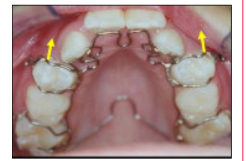
Fig. 6b - Lateral and A-P expansion with elastic attachment for reverse pull facemask.

untouched, i.e. there is an imbalance of the cranial structures which is not being addressed. This creates a risk of the joint dysfunction reappearing despite stabilization of the mandible and the temporomandibular joints. If extensive restorative procedures have been done to maintain the correction, this perpetuates the cranial imbalance. In contrast, in a balanced state the cranial mechanism functions without restriction. This is paramount in achieving both dental correction and stability of the temporomandibular joint function.