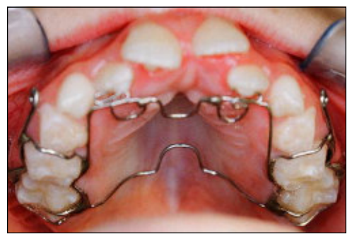
Fig. 3 - Lateral and A-P development with elastic attachment for reverse pull facemask.

Lightwire Functional (A.L.F.) appliances used in each case in conjunction with Class III elastics during the day and reverse pull facemask at night. Full treatment of the inferior strain patient is described in our article on that strain.<sup>6</sup> By developing the maxilla and repositioning it anteriorly, a significant alteration in airway can be achieved.